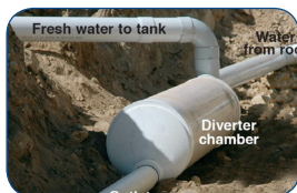
Belowground - First Flush Diverter