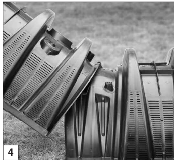
4 Connect the chambers.

Note: The connector hook serves as a guide to ensure proper connection and does not add structural integrity to the chamber joint. Broken hooks will not affect the structure nor void the warranty.