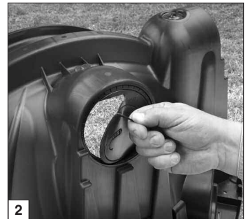
Pull tab on tear-out seal.