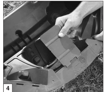
Install splash plate.