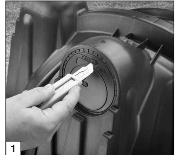
Start tear-out seal.