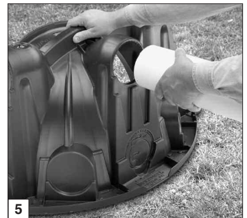
Insert inlet pipe.