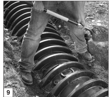
9 Walking-in the fill.

9. To ensure structural stability, fill the sidewall area by pulling soil from the sides of the trench with a shovel. Start at the joints where the chambers connect. Continue backfilling the entire sidewall area, making sure the fill covers the louvers.