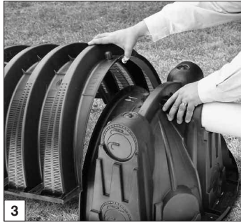
3 Place first chamber onto end cap.

3. Place the inlet end of the first chamber over the back edge of the end cap.