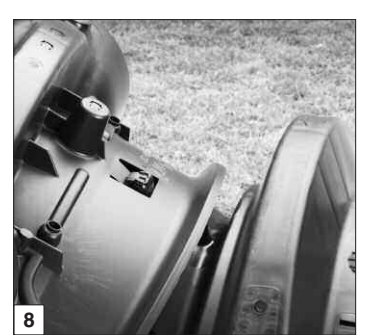
Attach end cap to chamber.

lower the end cap to the ground to snap it into place. Do not remove the tear-out seal.