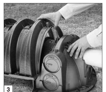
the ground to connect the Place first chamber onto end cap .

8. The last chamber in the trench requires an end cap. Lift the end cap at a 45degree angle and insert the connector hook through the opening on the top of the end cap. Applying firm pressure,