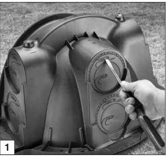
Start tear-out seal.

1.With a screwdriver or utility knife start the tear-out seal at the appropriate diameter for the inlet pipe. The seal allows for a tight fit for 3-inch, 4-inch SDR35, and 4-inch SCH40 pipe.