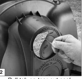
Pull tab on tear-out seal.

2. Pull the tab on the tear-out seal to create an opening on the end cap.