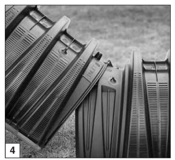
Connect the chambers.