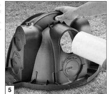
Insert inlet pipe.

5. Insert the inlet pipe into the end cap at the beginning of the trench. Extend the pipe into the end cap roughly 4 inches. (Screws optional.)