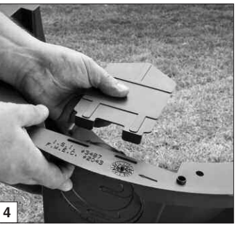
Install splash plate.

4. Install splash plate into the appropriate slots below the inlet to prevent trench bottom erosion.