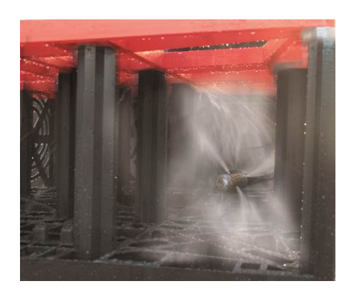
Jet washing the system

Regularly checking the infiltration/attenuation system will ensure high performance and guarantee the rapid distribution of surface & rainwater in the event of heavy rainfall of a high intensity.