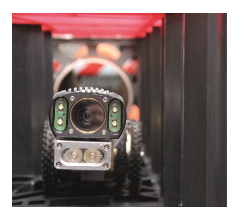
Inspection with camera